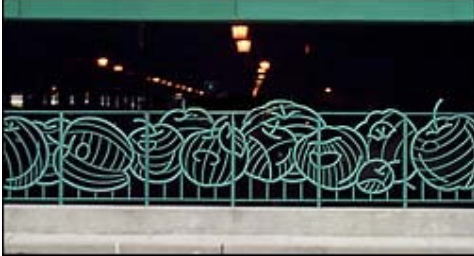
Ronald Reagan National, Washington