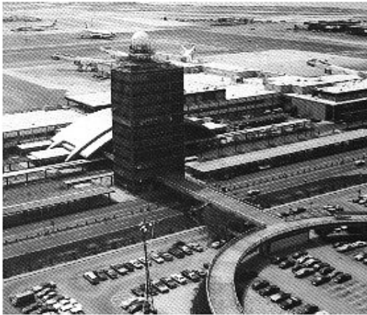
Terminal 4 at J F Kennedy International, formerly known as the International arrivals terminal, with its Ground Control building

Enjoy these landings at airports around the world.