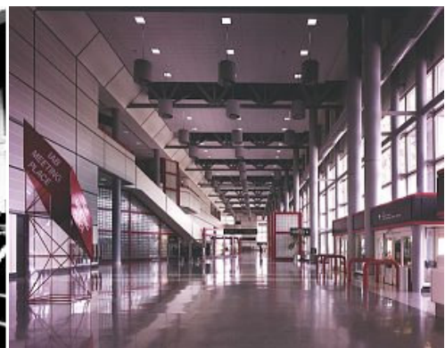
The airport interior of the past (Croydon Airport, London, in the 30s) and of today (George Bush Intercontinental, Houston, TX, USA) is strikingly alike